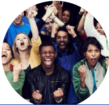
A movement for missional communities